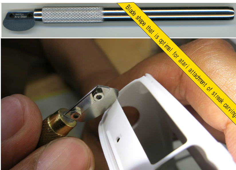
Micro vario saw Circle Set. (Aluminum)

Example) For muscle carving in triangular shape such as corner of corner. Since the tip is curved, It is easy to enter, it is ideal for fine work with oblique shape